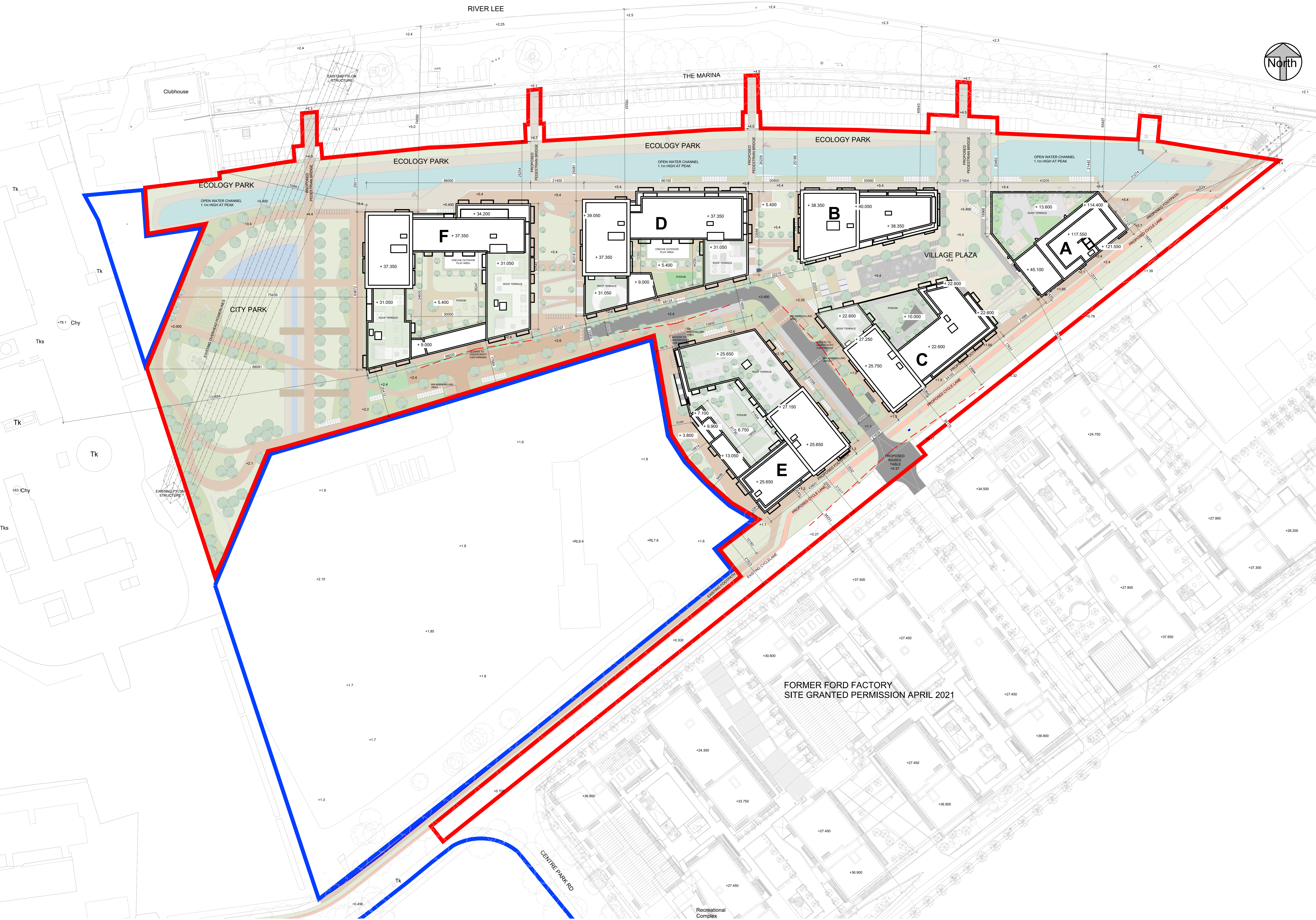
PROPOSED SITE PLAN 1:500

NOTE: FOR SURFACE TREATMENTS PLEASE REFER TO LANDSCAPE MASTERPLAN (7248-L-2000)